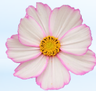
Master. Pushkar Peshwe 9 th Std