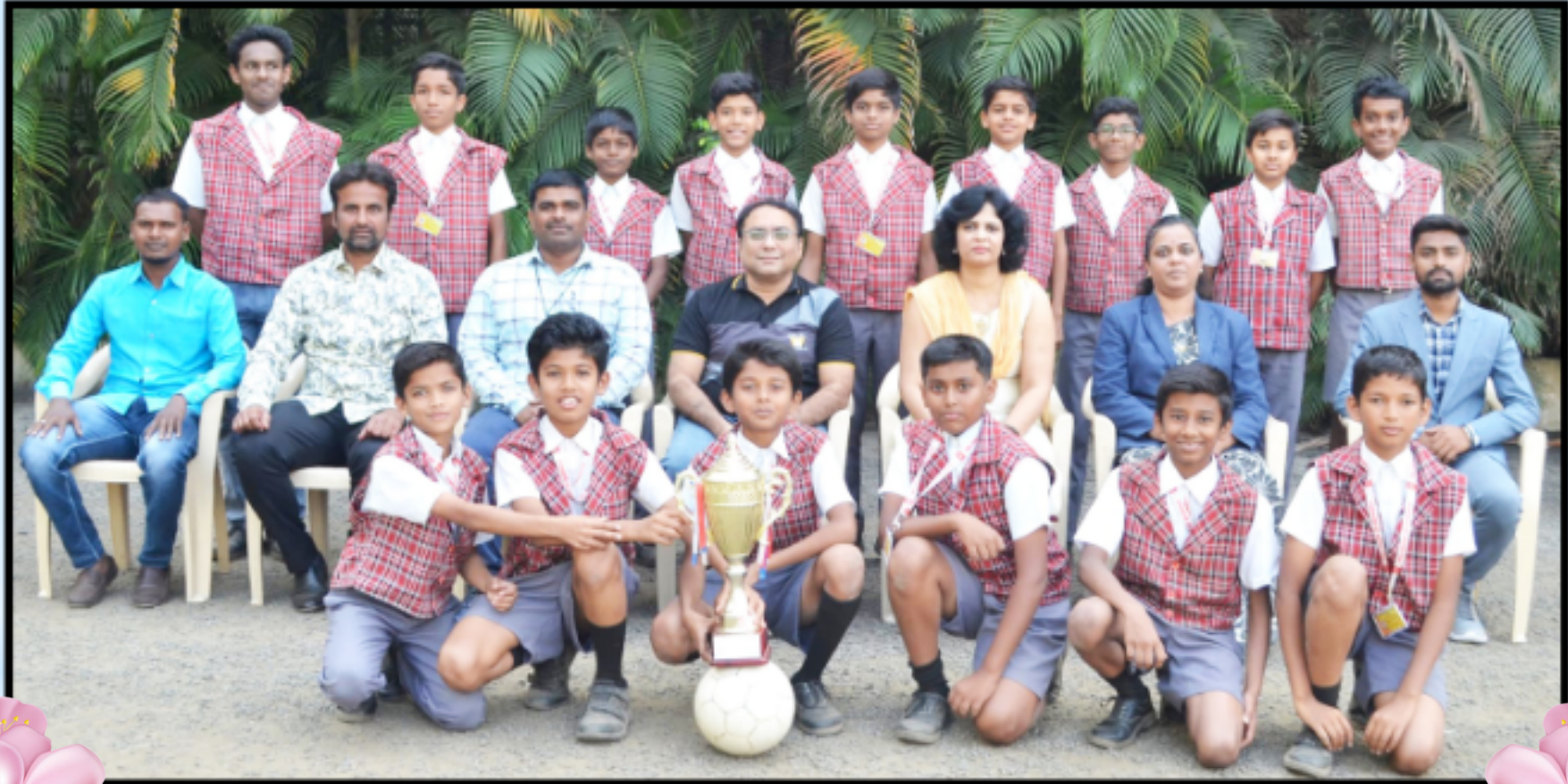
Interschool City Level U-14 Boys Football Winner Team