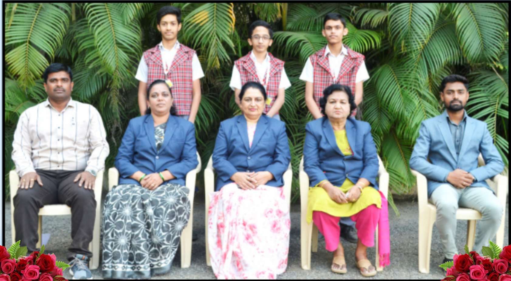
Interschool City Level Badminton U-17 Boys Winner Team