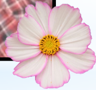
Master. Pushkar Peshwe 9 th Std (Silver Medal)